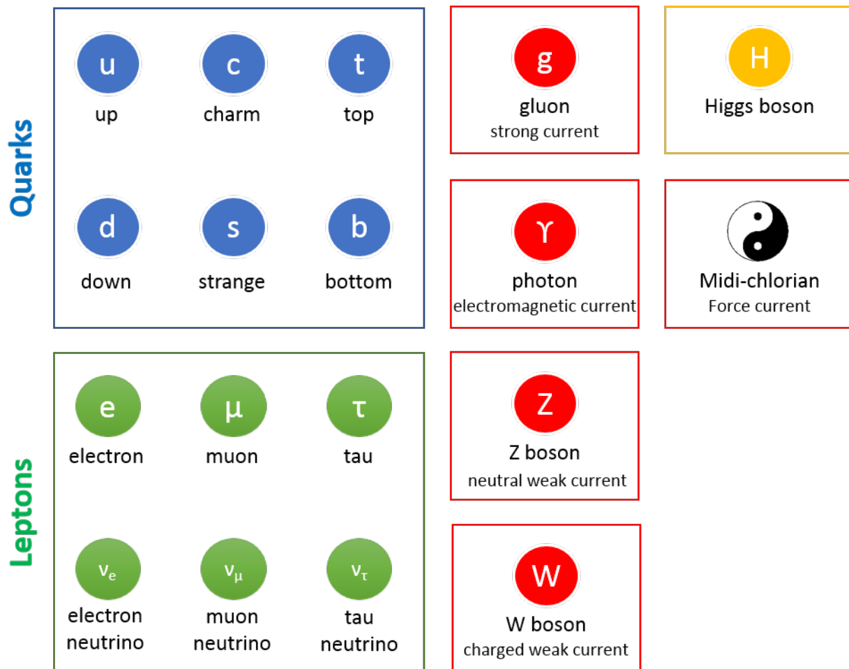
Figure 3. Extended Standard Model including the Force. The yin-yang symbol represents two “flavors” of the Midi-chlorian particle: light side and dark side.