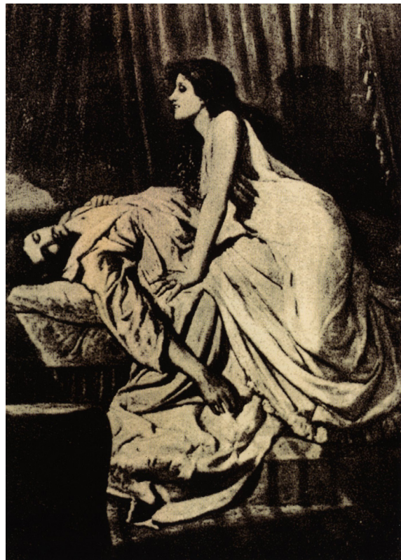
Figure 3. The Vampire, by Philip Burne-Jones (1897).

What about the vampires themselves? Today, they are usually believed to be undead creatures with supernatural powers: they don't age, can fly, and can fully regenerate from almost any wound. They have a taste for human blood (Fig. 3), but are afraid of sunlight, silver, religious symbols, and garlic. Vampires can be killed by decapitation or a wooden stake through the heart. The last but most important thing is that vampires can't reproduce; they can only turn a human into a vampire.