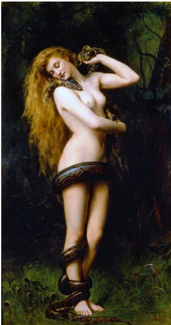
Figure 2. Lilith, by John M. Collier (1892), oil on canvas. Source: Wikimedia Commons.

Nearly every culture around the world has its blood-drinking creature. The ancient world had the female demons Lilith (Fig. 2; Babylonia) and Lamia (Greece). In Africa, the Ewe folklore believes in Adze, a vampiric being that can take the form of a firefly. Chilean Peuchen was a gigantic flying snake that could paralyse, and in Asia Penanggal was a woman who broke a pact with the devil and has been forever cursed to be a bloodsucking demon. So, why is it that vampires are known around the globe? Isn't it suspicious?