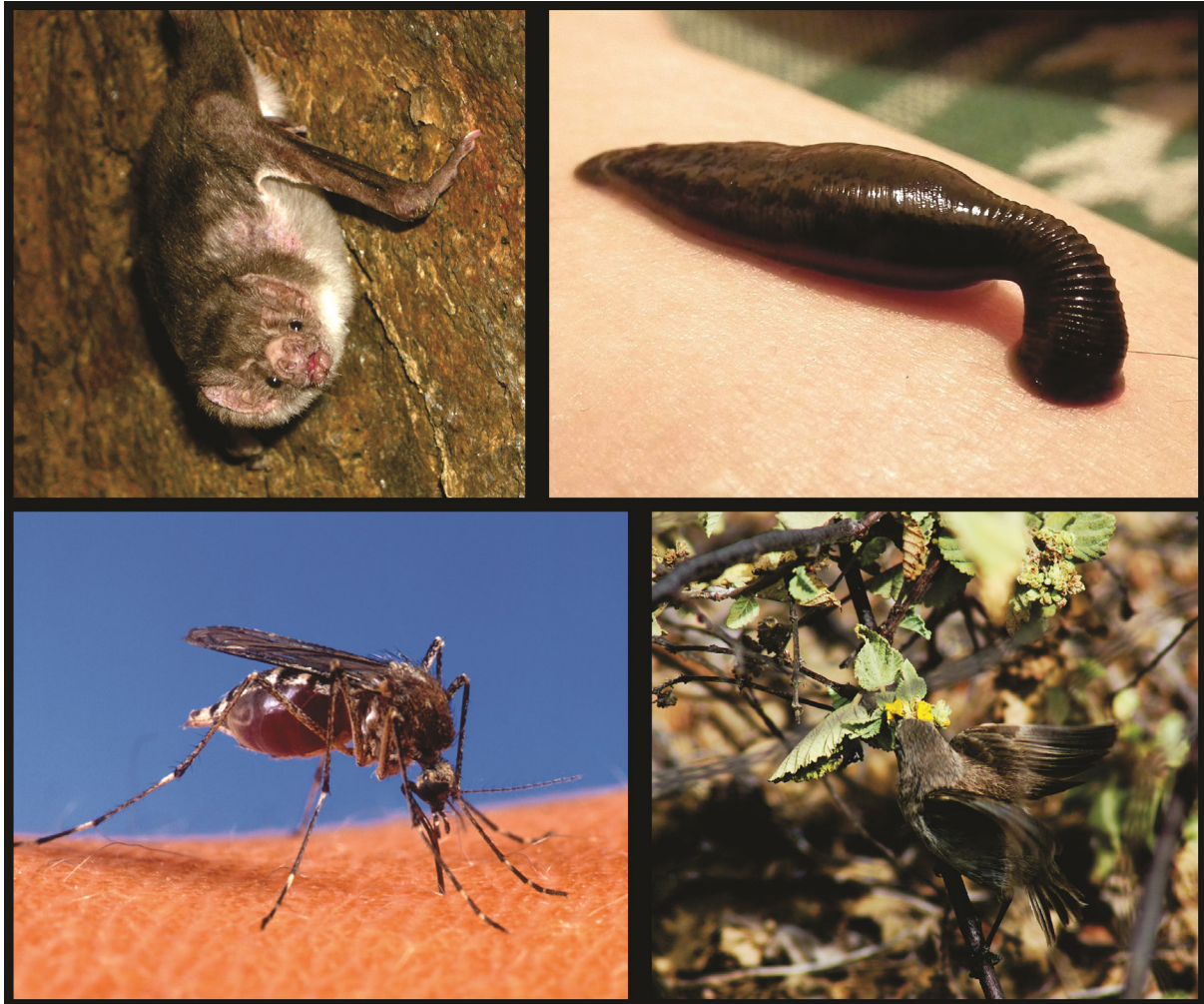
Figure 4. Top left: vampire bat Desmodus rotundus , from Peru; source: Wikimedia Commons (Acatenazzi, 2005). Top right: medicinal leech Hirudo medicinalis ; source: Wikimedia Commons (GlebK, 2011). Bottom left: Aedes (Ochlerotatus) sp.; source: Wikimedia Commons. Bottom right: vampire finch Geospiza difficilis septentrionalis ; source: Wikimedia Commons (P. Wilton, 2009; cropped).

have sucked with their hungry compatriots. That's a real friendship!