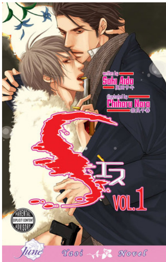
Figure 7: Cover of Esu (Taiyoh Toshio, 2005), the novel with the shortest title in our list. Image extracted from Wikipedia.