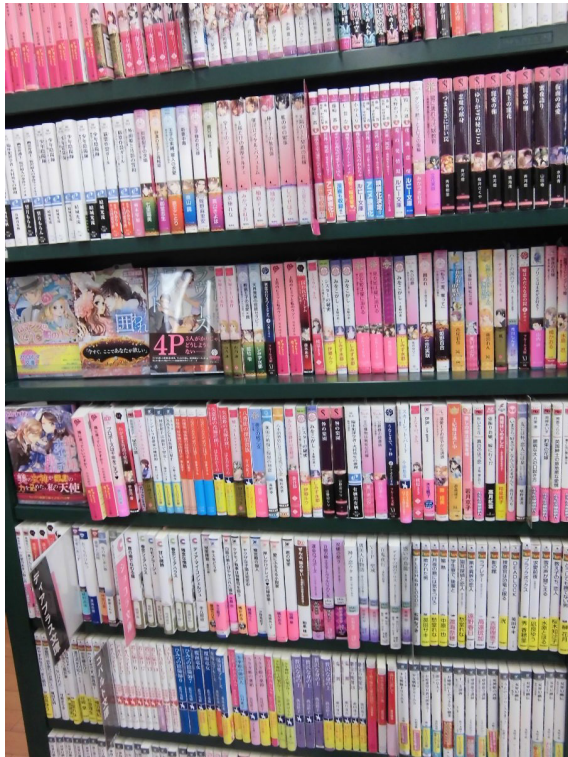
Figure 9: Light novels can have their whole title written in their spine, as well as specific and easily recognizable colors to make them easy to find.

words girl and sister in English titles, but is more varied in Japanese: musume (daughter), otome (maiden), imouto (younger sister), kanojo (girlfriend), and shoujo (girl).