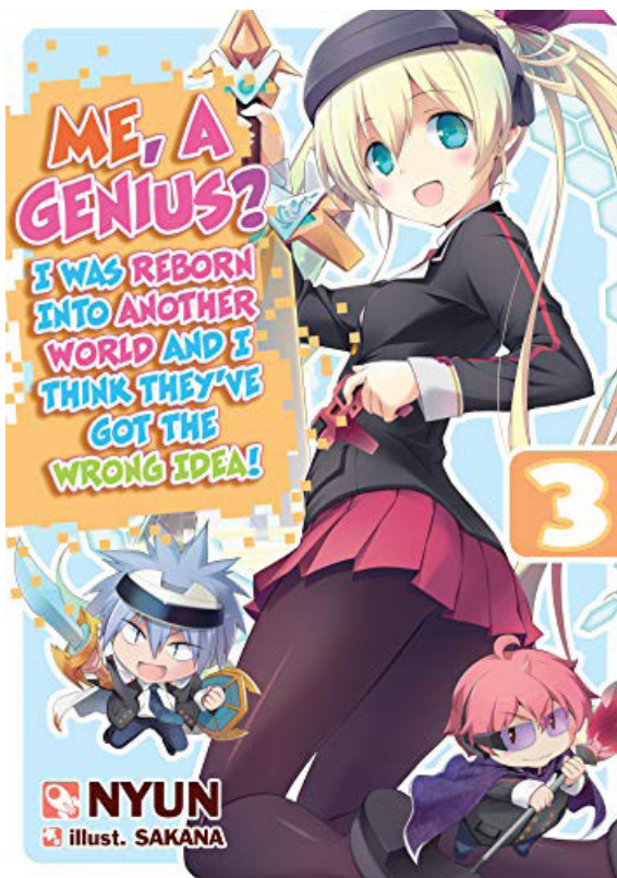
Figure 3: Cover of the light novel Me, a Genius? I was Reborn into Another World and I think they've got the Wrong Idea! (J-Novel Club, 2018). One can only wonder what the plot for this light novel entails.

A very peculiar feature of light novels is their titles. The titles are (in)famous for being unusually long, often composed of large sentences that give a summary of the plot, interjections, and filled with excessive punctuation marks such as exclamation and interrogation marks (Fig. 3). An article from the satirical anime news website Anime Maru, even joked about the possibility of the release of a light novel composed solely of a 196-page-long title (Anime Maru, 2016).