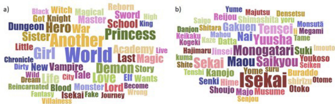
Figure 8: Word clouds with the most common words in light novel titles: a) English titles; b) Japanese titles.

Other very common themes are school settings. This includes the words school (gakuen) and words related to girls/women in general (considering that the majority of the audience is expected to be male teenagers and young adults). The latter includes the