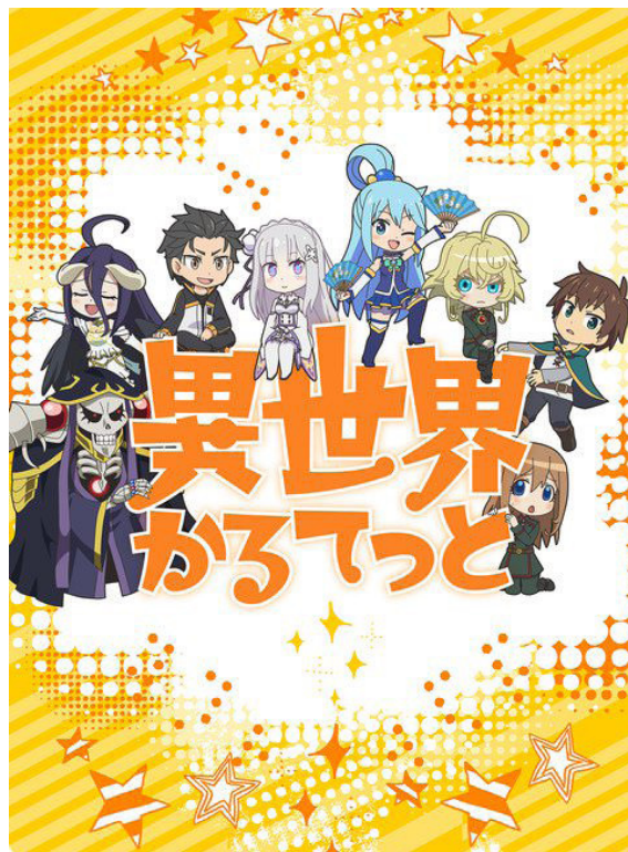
Figure 2: Isekai Quartet promotional art. A crossover show featuring characters from the popular isekai series Overlord , Re:Zero , KonoSuba and The Saga of Tanya the Evil .

franchise mimics this participatory culture of the digital age, Sword Art Online was born out of the actual user participation in the creation and dissemination of the media content. The success of Sword Art Online has contributed to the creation of many write-your-own-fiction websites in Japan over the past years.