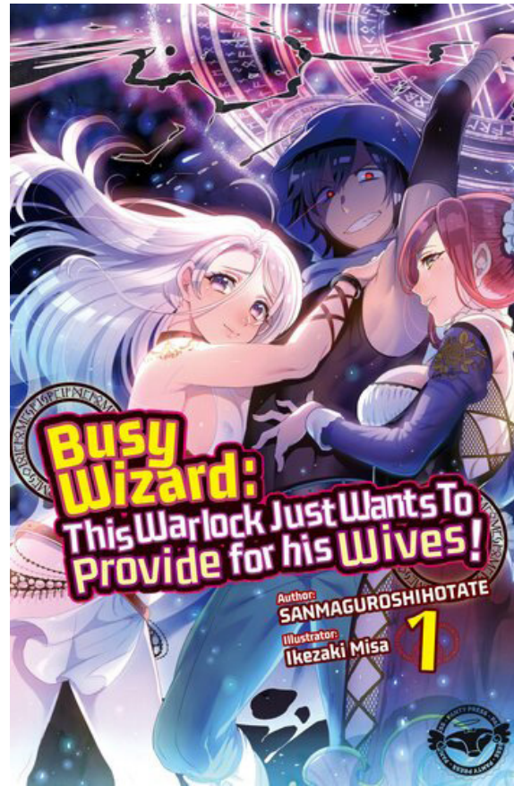
Figure 5: Cover of Yami Zokusei no Mahoutsukai daga, naze ka Yuusha ni Natte Shimatta ~Sore wa Tomokaku Yome ni Ii Kurashi wo Saseru Tame ni Ganbatte Nariag-arou to Omou (Panty Press, 2018; yes, that's the name of the publisher), our wordiest title, and probably the lewdest novel in our list as well.

It is relatively easy to fit the segmented curves when it is known in advance where each transition point is. When the transition points are unknown, as in our case, the problem becomes more difficult and we need to use the data to estimate where the transition points are. Hudson (1966) developed an algorithm to obtain the best fit iteratively. With a large number of transition points, this iterative procedure can be very complex, but as we are assuming the existence of a single point (that is, a specific year when the trend started), it is much simpler to proceed testing every point for the best fit for the method of least squares.