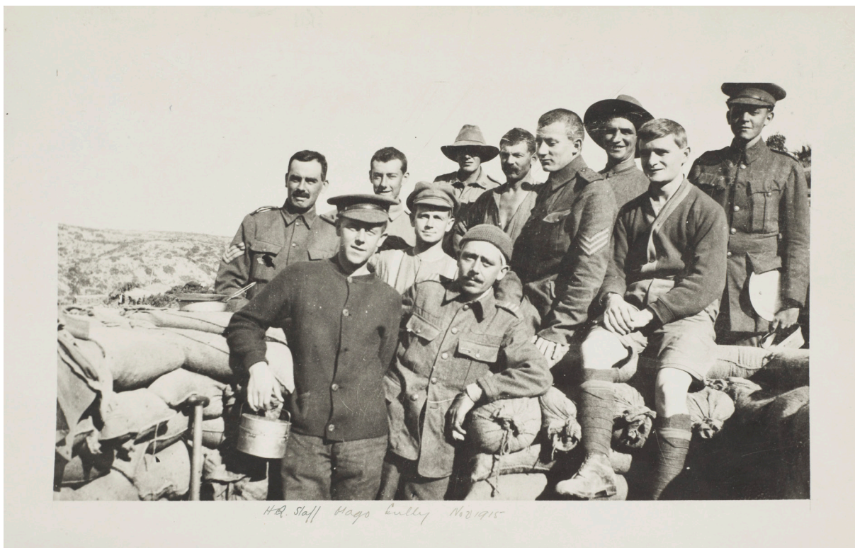
Otago Gully Headquarters staff; Gallipoli, November 1915. Photo by Lawrence Doubleday, from the archives of Museum of New Zealand Te Papa Tongarewa (NMNZ CA000316/002/0017).

I feel that The Landing does a good job of abstractly reflecting the real-life events of what happened on April 25 th , 1915 while also providing an enjoyable gaming experience for the player. While all of the history is there (from the locations to the unit badges), we did take some liberties. For example, because of the random nature of the Terrain Card setup it is possible for the map to be ahistorical. But even this was not without