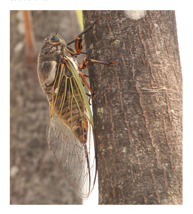
Figure 10. Cryptotympana facialis, photographed in Aichi prefecture. Source: Wikimedia Commons (photo by Alpsdake, 2013). Have you realized that this Alpsdake person is the one who took all the best photos of cicadas available on Wiki Commons?

hear kumazemi in anime.<sup>5</sup> Nevertheless, it makes an appearance in Fate/Grand Order — without the sound effects — during the 2022 Summer Event (US version), with Illya and Gudako<sup>6</sup> talking about how loud the cicadas are.