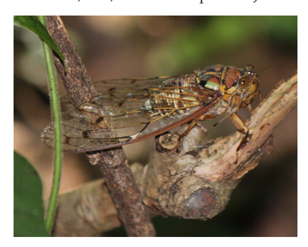
Figure 8. Female Tanna japonensis , photographed on the Yumihari Mountains.

Higurashi (the cicadas, not the anime) are about 4.5 cm long, counting the wings, with females being a bit larger than males. It can be found from Hokkaido in the north to the Amami Islands in the south (Hayashi & Saisho, 2015). While this species is considered to be a late summer to early autumn species (singing from September to October), it can actually be heard from the end of June to the end of August (Hayashi & Saisho, 2015). That matches the story of the anime, btw, which takes place in June.