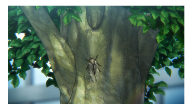
Figure 1. For instance, while I was writing this article, a new (summer) episode of The Devil Is a Part-Timer! came out, featuring this cicada with a rather generalized design. Screen capture from the anime (season 2, episode 05; Studio 3Hz, 2022).

Many people don't pay much attention to nature, be it the real thing or in fiction, so if you think you have never heard cicadas, just go back to one of the almost-mandatory episodes in your favorite anime (summer holidays, festival/fireworks, beach trip) and check it out. They are so prominent that, as a Redditor put it, they are the best supporting character in every anime.