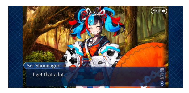
Figure 9. Artistic interpretation(?) of Sei Shōnagon. Screen capture from Fate/Grand Order (Delightworks/Lasengle, 2015–present).

Shōnagon mentions them, as expected of Japan's first super famous writer.