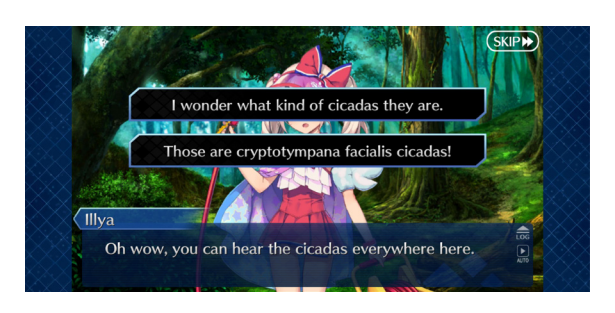
Figure 11. Gudako is showing off her entomological knowledge in this scene. Though the translators have failed miserably; I can forgive the lack of italics, but the scientific name must start with a capital letter. Bad civ! Screen capture from Fate/Grand Order (Delightworks/Lasengle, 2015–present).