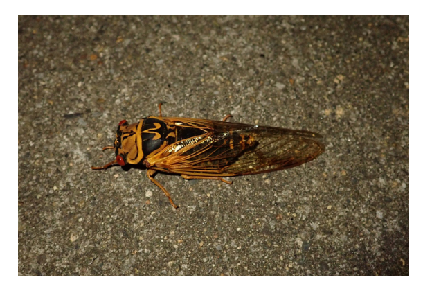
Figure 14. Auritibicen flammatus, photographed in Niigata province.

In Japan, there are six species of ezozemi (Hayashi & Saisho, 2015; Lee, 2017): A. bihamatus (コエゾゼミ or koezozemi), A. esakii (