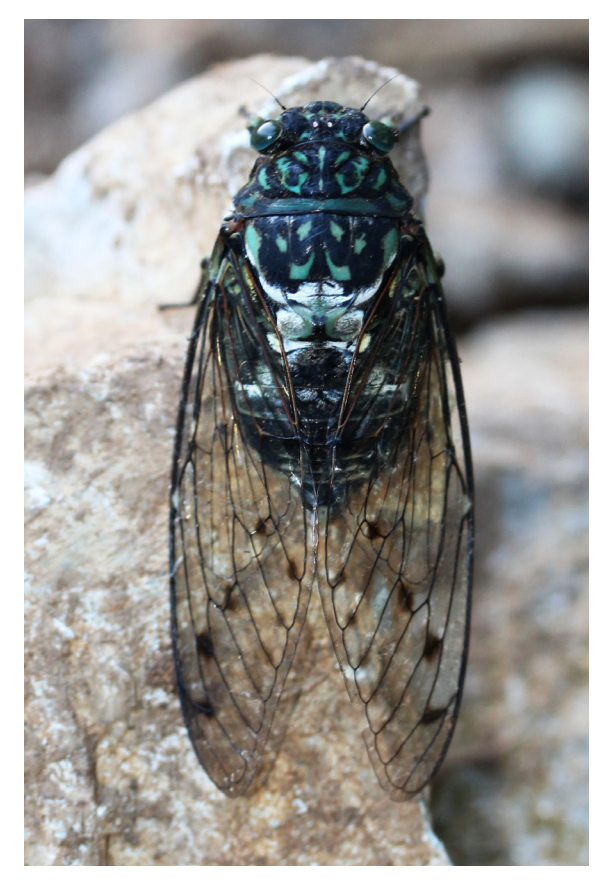
Figure 7. Hyalessa maculaticollis , photographed on Mount Ibuki.

And no wonder it is a common sound in anime: this species can be found throughout most of Japan, from southern Hokkaido to Kyushu (not to mention the Korean peninsula and adjacent eastern Russia and China; Hayashi & Saisho, 2015; Liu et al., 2017). Besides, they seem to perform well in human-altered environments and are therefore very common in urban areas (Nguyen et al., 2018).