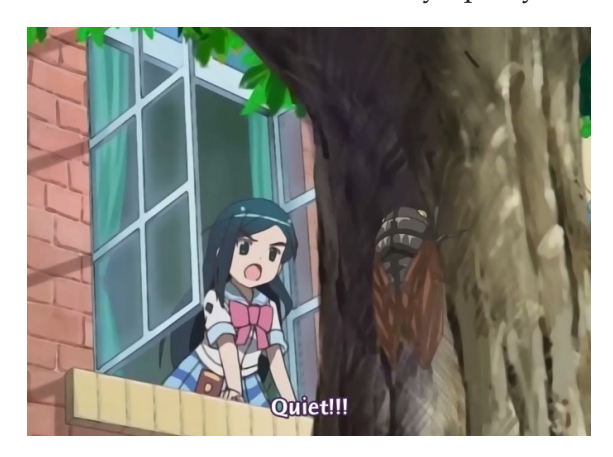
Figure 2. Urusai!!! Screen capture from Gakuen Utopia Manabi Straight! Screen capture from the anime (episode 07; Ufotable, 2007).

Not everyone likes cicadas, though. Their sound can be almost deafening at times and they can also cause damage to infrastructure (Cyranoski, 2007; McKirdy, 2019; Moriyama & Numata, 2019). Besides, they are usually not very pretty, to put it mildly, and they fly and collide with people walking by. Entomologists who research cicadas will tell you, however, that these creatures are among the "most charismatic insects" (Marshall et al., 2018: 4). Whether you agree with them or not, that's entirely up to you.