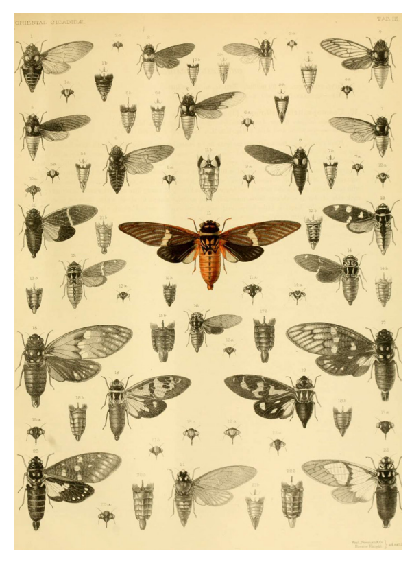
Figure 3. An 19th-century naturalist illustration of cicada species, showing a bit of their diversity in India and neighboring regions. Image extracted from Distant (1889–1892: pl. 3).

The Tettigarctidae have a long evolutionary history, the oldest fossils date back to the final part of the Triassic period, circa 205 to 201 Ma (millions of years ago) (Grimaldi & Engel 2005; Moulds, 2018). Cicadidae, on the other hand, are a much younger group. They have been around since the Paleocene, a geological epoch that lasted from circa 66 to 56 Ma (Grimaldi & Engel 2005; Moulds, 2018).