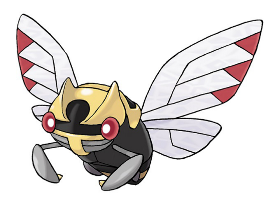
Figure 12. Ninjask, official artwork from Pokémon (The Pokémon Company).

It can't be helped, I must also talk about the potentially most prominent of fictional cicadas in Japanese pop culture, the Pokémon Ninjask or \overline{\tau} " \tau " (Tekkanin).