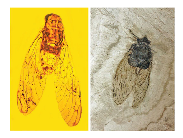
Figure 4. Examples of fossil cicadas. The one on the left, Minyscapheus dominicanus (from the Dominican Republic), is preserved inside a piece of amber. The one on the right, Miocenoprasia grasseti (from France), is a "regular" fossil, preserved in stone. Images extracted from Moulds (2018: pl. 3, figs. 4, 5).